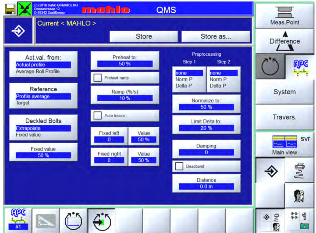
Fig. 1: APC Settings