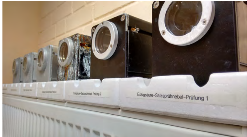
Test series corrosion resistance

Acid absorption, high humidity, aggressive chemicals: Life is not easy for machine components in the textile finishing industry. Mahlo has identified the demands of the market and has used its over 70 years of experience to optimise the individual components for exactly this kind of environment.