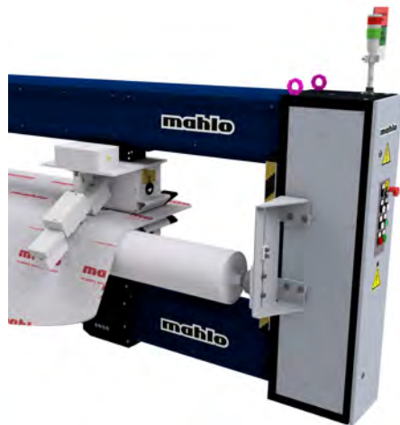
Fig. 2: Calipro DMS on Webpro M

If the manufacturer is able to check the thickness of the individual coats, he has already established the basis for his success. Only when the exact values are known can they also be correctly controlled thereby optimising the production processes. If, for example, the application of excess quantity is thus prevented, costs and raw materials are saved. The result is a cost-efficient and, at the same time, high quality product that ensures satisfaction for the dealer and customers.