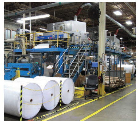
Spinnaker Line #18