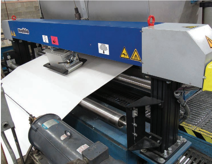
Mahlo Scanner on #18 with IMF-15 Infrared Sensor

more advanced solution and eliminate the added cost and regulations surrounding the use of radioactive materials.”