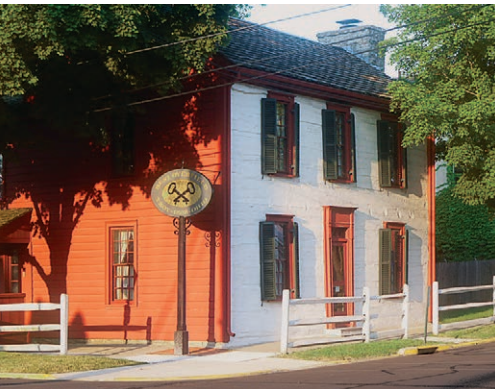
Settler-built Benjamin Overfield Tavern circa 1808

As well, the folks who created, nurtured, and now sustain the success of Spinnaker, a Mactac Company, are equally attentive to the quality of the products they craft. Founded in 1928 by two