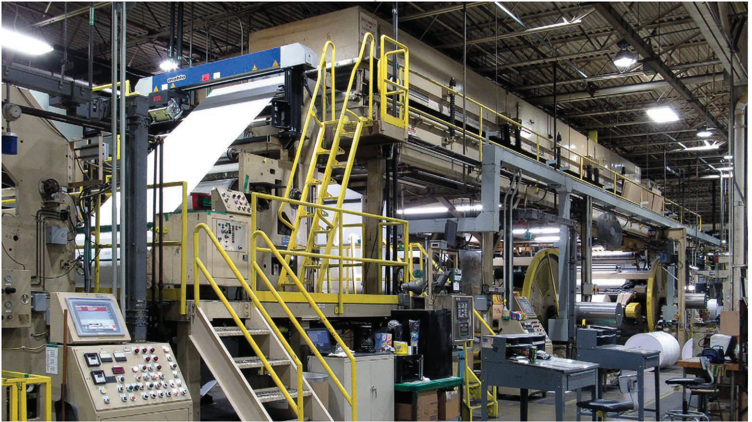
Spinnaker coating line #19

in the process of vetting the Spinnaker acquisition, it was great to see that they partnered with Mahlo as well. We have been very pleased with the technology, expertise, and customer support that Mahlo delivers.”