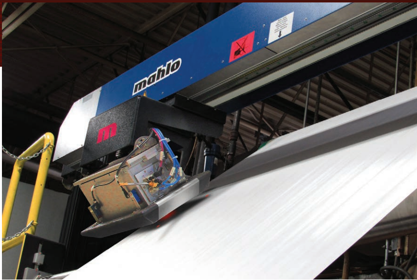
Mahlo custom engineered the scanner mount, adapting to available space on line #19.